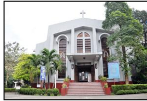
Chapel of the Lilies