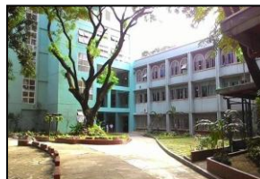
High School Building